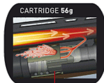
ACTIVE VALVE SYSTEM